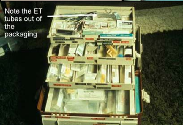
Note the ET tubes out of the packaging