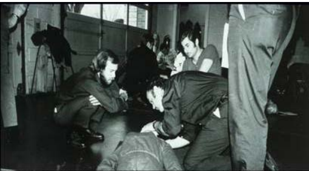
Because there was so much opposition to these new care providers that were going to challenge physicians and take away nurses' jobs, he had to train the first EMT class in his garage (1972)